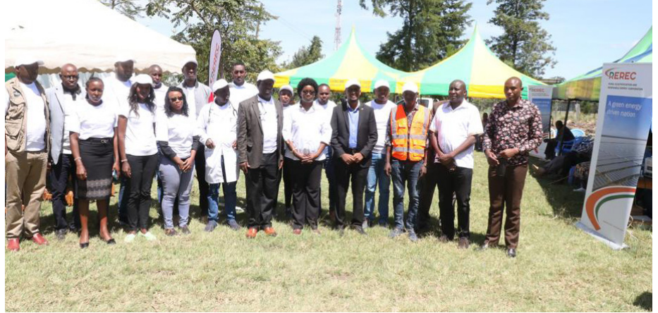
Rerec team with Bomet County officials at Chebunyo Health Center.

REREC in partnership with the County Government of Bomet successfully conducted a free medical camp at Chebunyo Health Center in Chepalungu Constituency where over 360 patients ailing from diabetes, hypertension and heart diseases were treated.