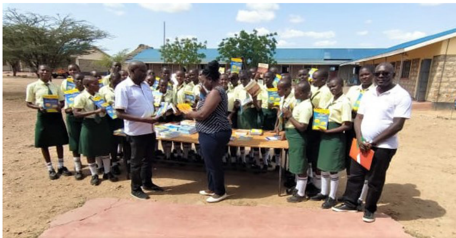
REREC staff donating textbooks at Milima Tatu Girls Secondary School

Turkana has the highest proportion of people with no education at all and citizens living there are seven times less likely to have secondary education than the average Kenyan.