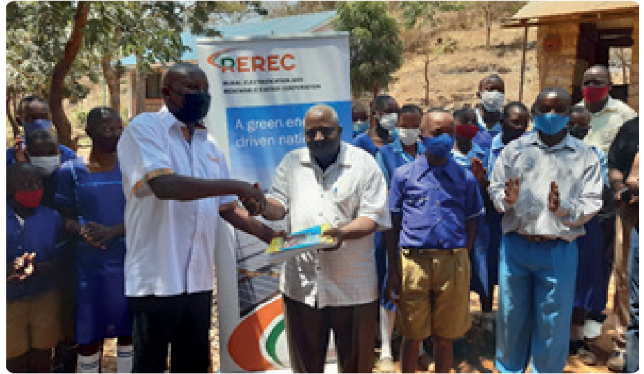
REREC donates books to schools

Despite having the vaccine, we must continue wearing masks, washing or sanitizing our hands, ensuring good ventilation indoors, physically distancing and avoiding crowds.