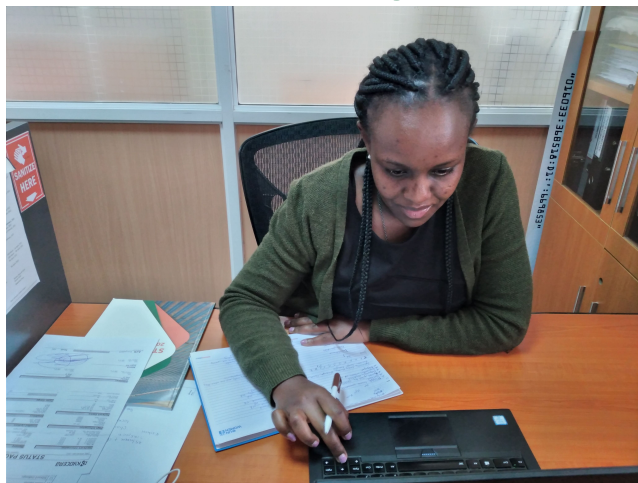
A new staff member at her workstation in Kawi House

This article was originally published in the original United States edition of Inc. or on inc.com and is the copyright property of Mansueto Ventures LLC, which reserves all rights. Copyright © Mansueto Ventures LLC.