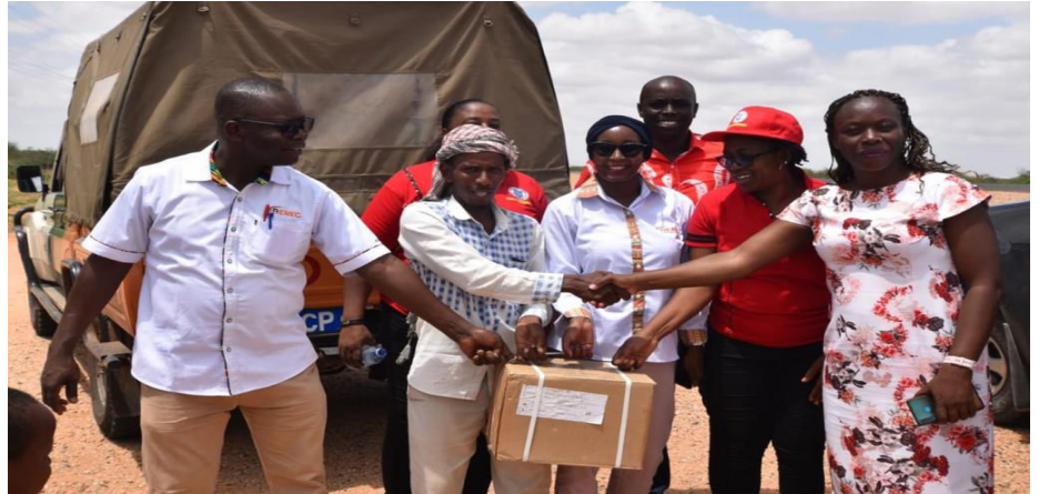
REREC staff at the book donation.

REREC and KLB jointly celebrated World Book & Copyright Day on 23rd April, 2022 by donating textbooks to pupils of Subo Primary school in Bura Constituency, Tana River County. The school has approximately 150 pupils.