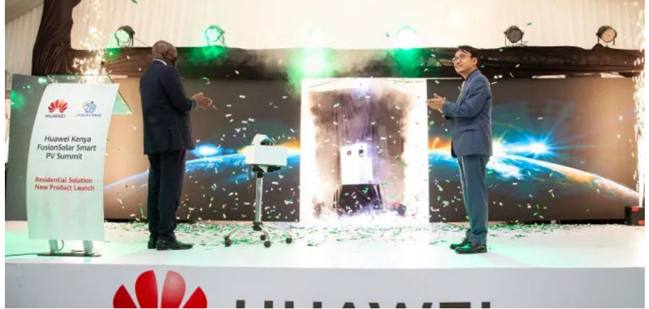
Huawei FusionSolar Eastern Africa Partner Summit

Kenya is keen to tap the idle potential in wind and solar energy to reduce reliance on thermal energy. Currently, renewable energy sources account for 54.3% share of the national energy mix with solar power's contributing only 2%. This means that the country needs heavy investment to boost solar and wind power generation to reduce reliance on thermal power.