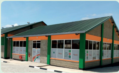
Branded Mweiga Stores

The Energy Act brought about expansion of REREC's mandates, accompanied by corresponding changes in operations, processes, additional stakeholders and most visibly, a new brand identity.