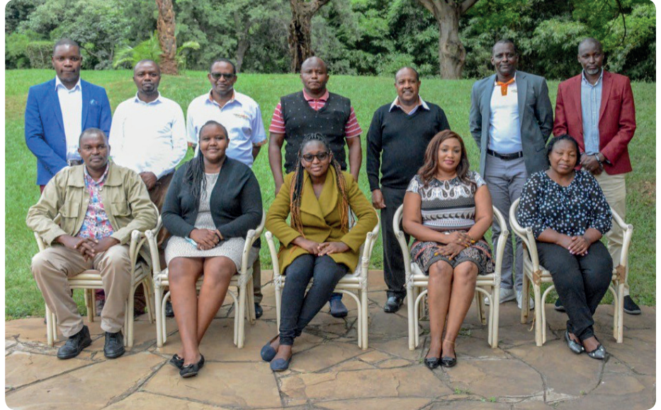
RSC members with the trainers from NTSA at the Utalii Hotel

The Administration Department recently organized an induction training for members of the Road Safety Committee in conjunction with NTSA. The Committee was formed as part of the Occupational Health & Safety (OSHA) requirements for Public Sector organizations to mainstream road safety as part of their performance contract and contribute to the prevention of road traffic accidents especially those involving REREC's vehicles and staff.