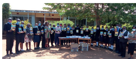
Joyous Pupils, Teachers and REREC officials during the donation of learning materials to Kakululo Secondary School in Kitui county. This is part of the Corporation's social responsibility of giving back to the community.

not able to provide all the resources necessary to provide quality education for their children.