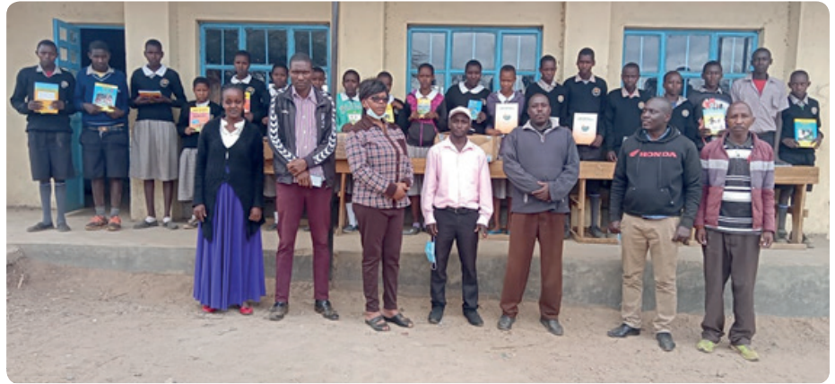
Pupils, Teachers and REREC officials posing for a group photo following the donation of learning materials to Kalia Primary School, Kitui County

REREC has donated learning materials and a water tank to three schools in Kitui and Narok Counties. The donation was made in-line with Corporation's CSR programme which aims to help improve the standard of education in poor communities within the areas where we undertake projects and in turn provide a conducive environment for students to learn in.