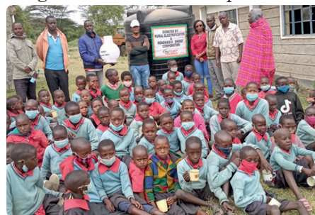
Group photo during the presentation of a 4,000 litre water tank to Empor primary school, Narok South constituency, Narok County.

The beneficiary schools which included Empor Primary School in Narok County, Kalia Primary School and Kakululo Secondary School in Kitui County, are from remote and marginalized areas where parents are