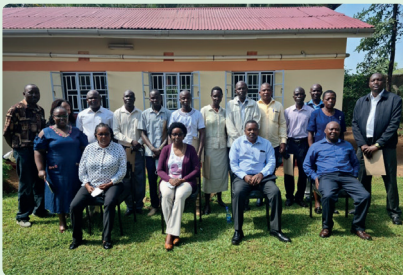
Bukura Energy Centre Staff after being issued with their transfer letter

As part of actualizing the transfer of Energy Centres to REREC in accordance with the expanded mandate under the Energy Act 2019, the Corporation last week finalized the issuance of transfer letters to all the staff in the sixteen (16) Energy centres across the country. The exercise which was spearheaded by the CEO was in readiness to their reporting in the first quarter of FY 2021/2022.